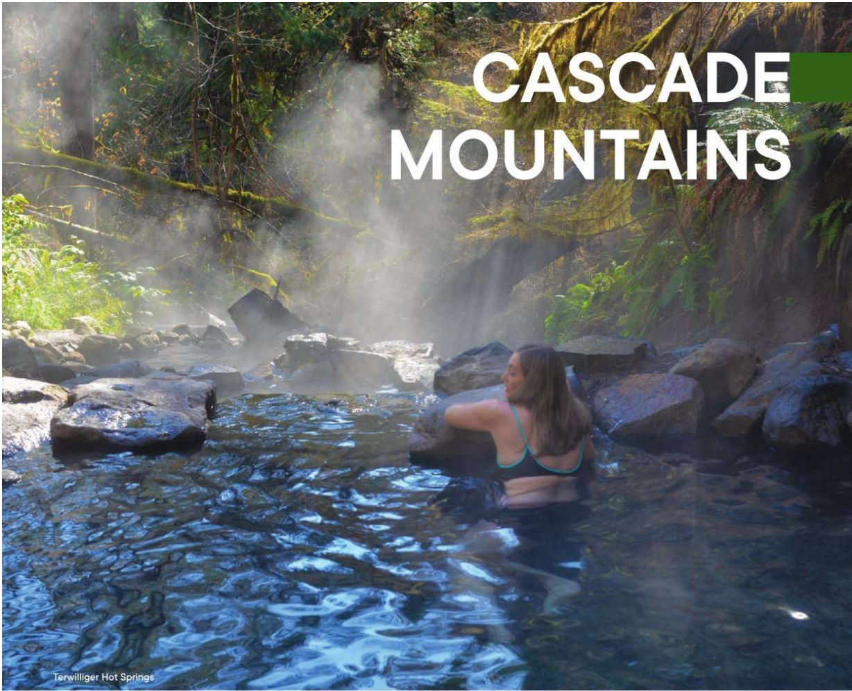
Terwilliger Hot Springs