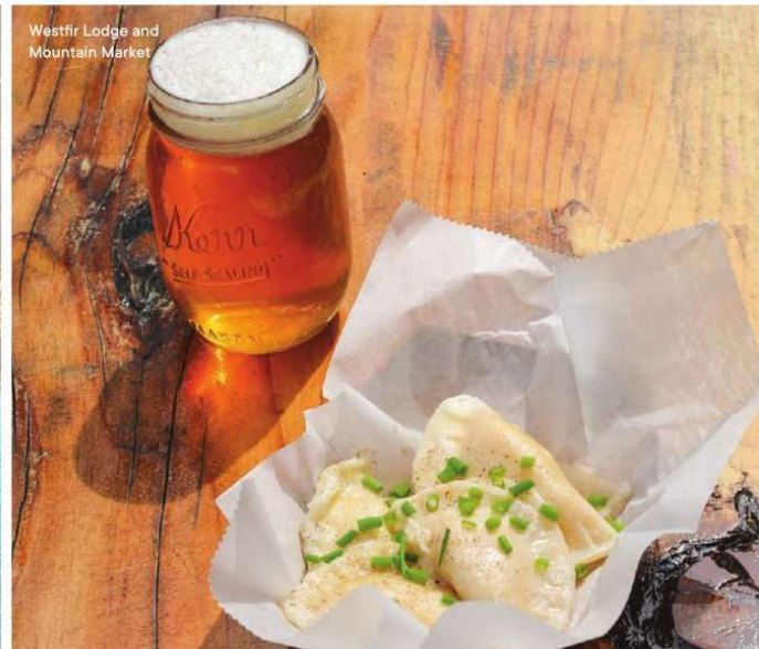
Westfir Lodge and Mountain Market