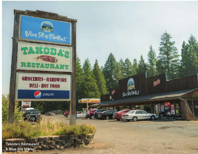
Takoda's Restaurant & Blue Sky Market