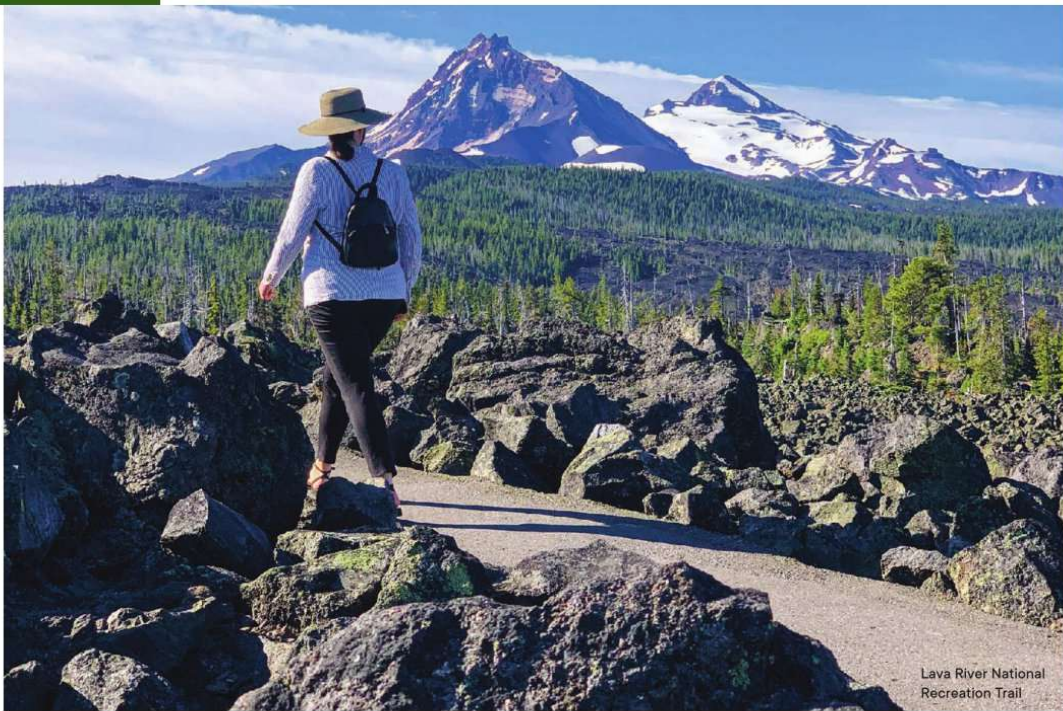
Lava River National Recreation Trail