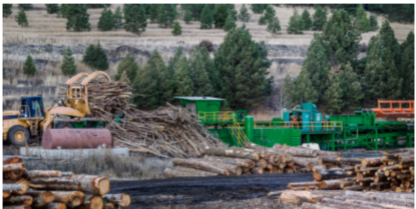
The SWFC steering committee visited Integrated Biomass Resources, located in Wallowa, OR in 2019 to learn about the benefits of biomass utilization.

MITIGATE WILDFIRE RISK IMPROVE FOREST HEALTH CREATE RURAL JOBS