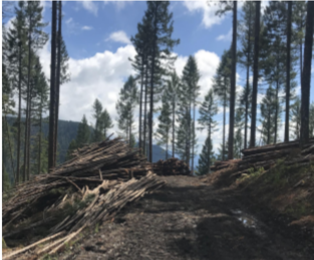
A BUC converts logging residues that would otherwise be burned as slash into products that create jobs and revenue.

A biomass utilization campus (BUC) is a facility that processes logging byproducts and non-timber woody material. This includes tree tops, slash and small or damaged wood.